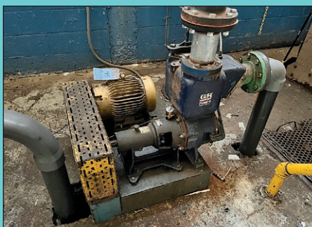
(2) 7.5 HP Gorman Rupp Water Pumps