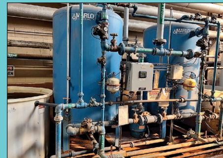
Mario Model MHC-1500-3 TW PLC SR Two-Tank Water Softening System

300 Micro Control, (2) Extra Small Poly Holding Tanks 48" Macon Model MA48SUE Vibratory Separator (2006) (2) 7.5 HP Gorman Rupp Water Pumps 3,000 Gallon Approx. Poly Wastewater Tank 200 Gallon Approx. Industrial Steam Boiler Return Tank; (2) 5 HP Pump Motors (2004) 4,000 Gallon Approx. Tempered Tank Economizer; (2) 20 HP Pumps Four-Pass Heat Exchanger