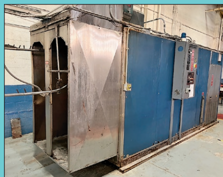
Colmac Model CTU-190 G/S RH Natural Gas Fired Pass-Thru Dry Cleaner