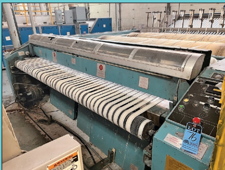
126" American Model 563 Super-Pro Three-Roll Ironer