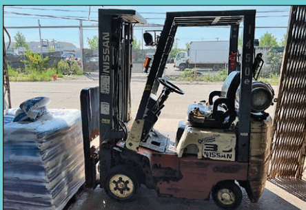
3,000 Lb. Nissan Model CPJ01A15PV LP Gas Solid Tire Lift Truck