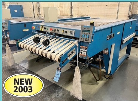
Chicago Model Air Chicago XL Small Piece Folder