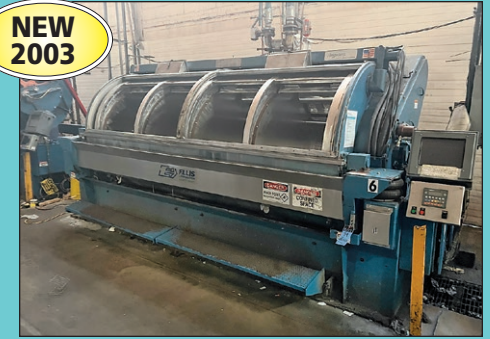
(2) 900 Lb. Ellis Model Z472R Four-Pocket Washer Extractors