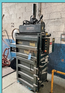
24" X 30" Galbreath Model MB2430 Hydraulic Vertical Baler