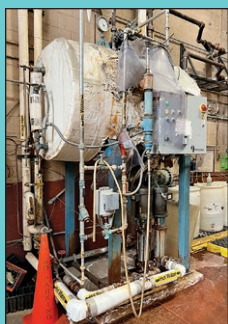
200 Gallon Approx. Industrial Steam Boiler Return Tank