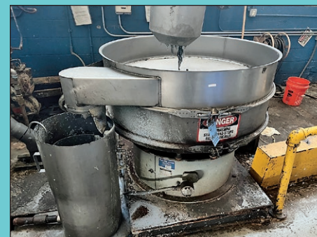
48" Macon Model MA48SUE Vibratory Separator