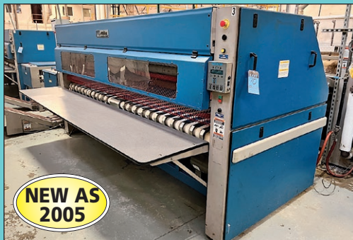
(4) 120" Chicago Model Skyline Folders