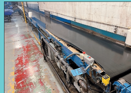
(5) Various Size Rubber Belt Conveyors