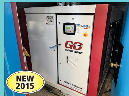
150 HP Gardner Denver Model EAQ99T Air Compressor