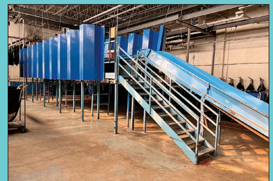
22-Station Soil Sort Conveyor & Mezzanine