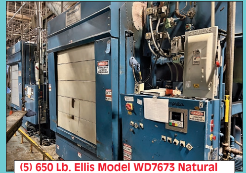
(5) 650 Lb. Ellis Model WD7673 Natural Gas Fired Batch Dryers