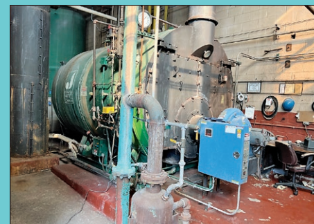
Johnston Natural Gas Fired Boiler w/ Industrial Combustion Gas Burner