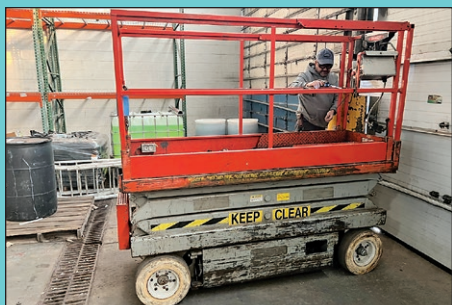
Skyjack Model SJ-3220 Electric Scissor Lift